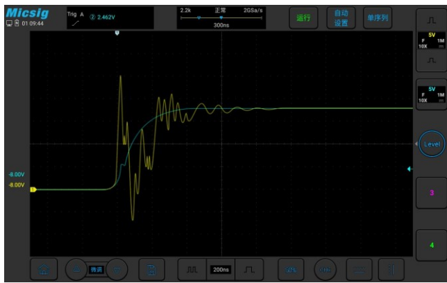
■ Differential Probe ■ SigOFIT Probe