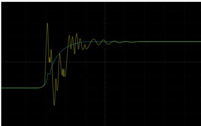
High Voltage Differential Probe SigOFIT Optical-fiber Isolated Probe